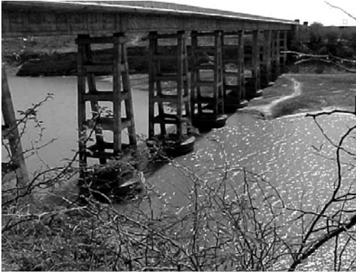
Figure 19-17. The Rudramata Bridge, the tallest in the region, supported on open-type reinforced concrete A-frame piers.