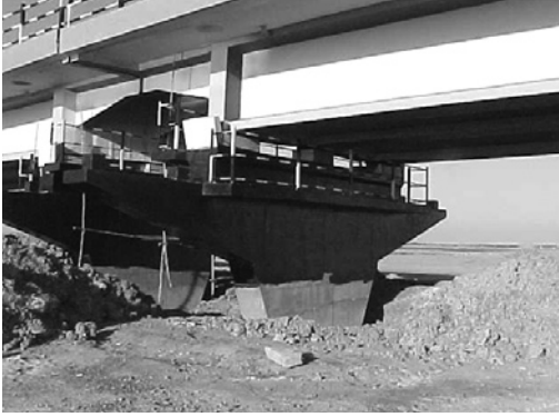
Figure 19-8. Girder-pier support system on the New Surajbadi Highway Bridge. Well foundation is not visible.