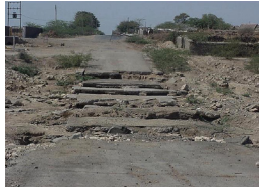
Figure 19-2. Collapse of roadway drainage structure between towns of Anjar and Bhuj.

India's highway system. The New Surajbadi Highway Bridge on NH8A, a four-lane divided modern toll road, was still under construction at the time of the earthquake. This new replacement bridge is constructed at a higher elevation than the existing road to better accommodate monsoon flooding.