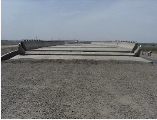
Figure 19-27. Failure of approach slab of a bridge at the village Vondh.