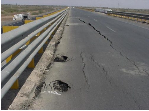
Figure 19-1. Roadway cracking between the towns of Gandhidham and Bhachau.