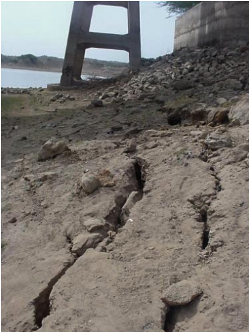
Figure 19-19. Ground cracks at intermediate and end piers. The ground around the Rudramata Bridge experienced extensive lateral spreading in the riverbed parallel to the south side riverbank on both the upstream and downstream sides of the bridge.