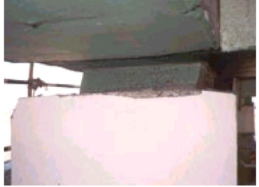
Figure 19-9. Severely strained elastomeric bearings of the New Surajbadi Highway Bridge.

The bearings and expansion joint at the abutment are completely dysfunctional and may not be repairable. Even though there were no transverse stops to prevent such lateral movement of the superstructure spans, the large size of the pier cap prevented the spans from dislodging.