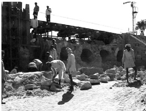
Figure 19-21. A damaged stone-masonry arch bridge, built in 1912. Temporary side supports (at left) are being erected to retain the ballast and open the traffic.