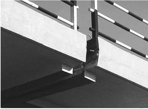
Figure 19-14. Transverse displacement of the superstructure decks of the New Surajbadi Highway Bridge.