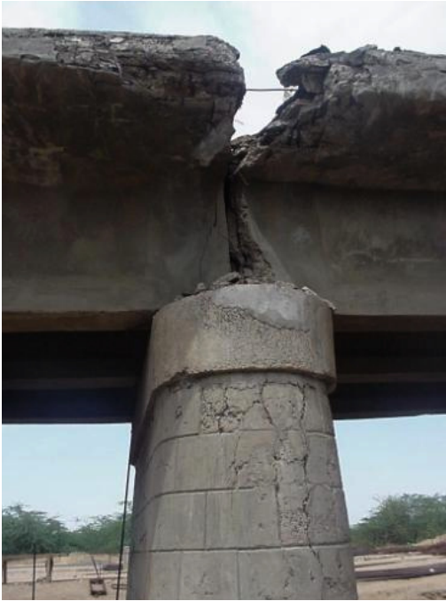
Figure 19-25. Failure of the girder end and expansion joint of a bridge between the towns of Gandhidham and Bhachau.