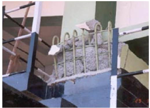
Figure 19-13. Damaged reinforced concrete stoppers showing poor bond between the epoxy-coated rebar and the adjoining concrete at the New Surajbadi Highway Bridge.

Elastomeric bearings displaced from their original locations by as much as 0.25 m and were severely stressed (Figure 19-9). This suggests that the shaking intensity may have caused either the uplifting of the girder or the sliding of the girders over the concrete pedestal along with the bearings. The use of plain elastomeric bearings is not suitable for high seismic regions and a shear pin is required to prevent sliding during earthquakes. Indian codes do not prevent plain elastomeric bearings from being used in high seismic regions. Damages were also observed to the concrete pedestals (Figure 19-10) and to the soffit of the girder at the ends (Figure 19-11).