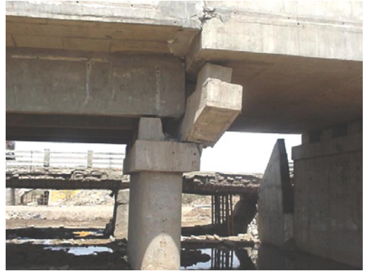
Figure 19-28. Failure of crossbeam of a bridge at the village Vondh.