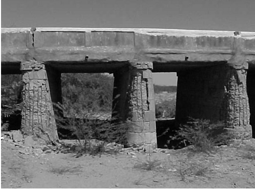
Figure 19-23. Weathered and poorly concreted piers further damaged by the earthquake. The concrete cover simply spalled off the piers.