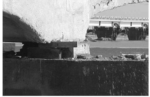
Figure 19-6. Damaged bearing on Old Surajbadi Highway Bridge. The New Surajbadi Highway Bridge (under construction) can be seen in the background.