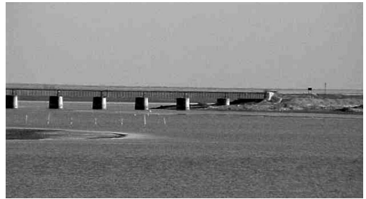
Figure 19-16. Near the south side abutment of the Surajbadi Railway Bridge.

There was no apparent or reported damage to the piers and foundations. But, large lateral (204 mm) and vertical (64 mm) relative displacements of the decks at some deck joints were observed (Figure 19-14). These vertical displacements indicate a possible settlement of the foundation. Damage to the deck joints due to mutual pounding of the two spans was observed (Figure 19-15).