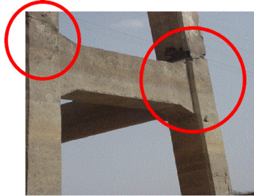
Figure 19-20. Flexural cracks in the columns and shear cracks in the beam-to-column joints occurred at the RC frame member junctions in the A-frame Pier No.2 of the Rudramata Bridge. The girders are deeper than columns, and use of flared beam-ends are noticeable. Spalling of cover concrete and corrosion of reinforcement bars is also evident at these locations.