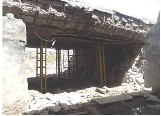
Figure 19-24. Failure of super and substructure of a bridge; rural area between the towns of Gandhidham and Bhachau.