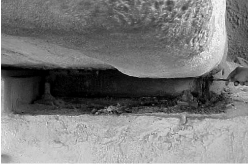
Figure 19-5. Roller bearing on the north side abutment of the Old Surajbadi Highway Bridge.