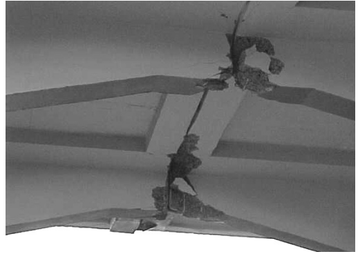
Figure 19-15. Pounding between two adjacent bridge spans, New Surajbadi Highway Bridge.