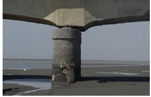
Figure 19-4. Relative longitudinal movement between the piers and the superstructure spans in the Old Surajbadi Highway Bridge.

the railway bridges included some steel superstructures as well. Damages include movement, damage and collapse of piers, abutments and wing walls; cracking of main girders; disintegration of bearing pedestals; damage to elastomeric bearings; collapse of parapet walls; damage to pier caps; collapse of approach embankments; and displacement, movement or breakage of reinforced concrete Hume pipes.