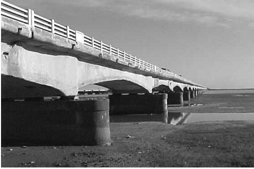
Figure 19-3. Old Surajbadi Highway Bridge.