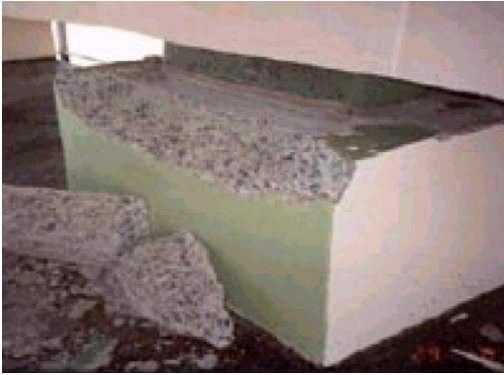
Figure 19-10. Damaged concrete pedestals of the elastomeric bearing of the New Surajbadi Highway Bridge.