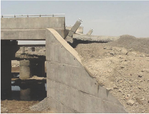
Figure 19-29. Failure of abutment of the bridge at the village Vondh.

Settlement of the approach backfill of between 300 and 450 mm was noticed in this short-span bridge. The repair of this bridge will require extensive work, including rebuilding of the abutment wall, expansion joint, backwall, wingwalls, backfill and approach slab.