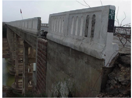
Figure 19-18. Collapse of the north end approach earthwork and of the parapet walls at Rudramata Bridge.