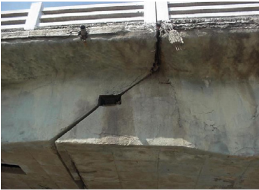
Figure 19-7. Failure of in-span hinge and traffic railings at Old Surajbadi Highway Bridge.

Liquefaction). The shallow well foundation with wall pier supported on top moved in the liquefied sand. Damage to the bridge indicates that there was both longitudinal and transverse movement of the bridge superstructure and substructure (Figure 19-4). The embankment at the north end of the bridge settled approximately 300 mm and moved toward the channel. This settlement and lateral spreading of the embankment extended to the bridge abutment and resulted in settlement of the roadway. The north abutment also moved westwards toward the channel. The foundation under Pier No.12 from the northern abutment has significantly tilted, shifting the alignment of the highway. Pier 14 rocked off its foundation.