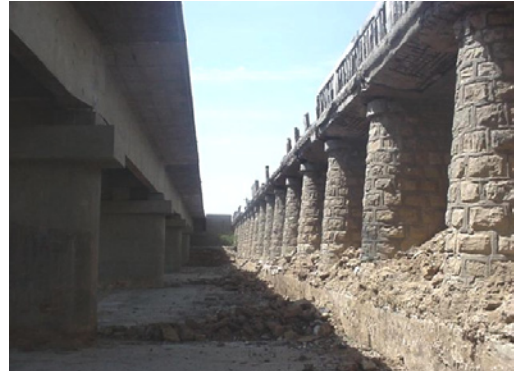
Figure 19-26. Failure of masonry wall pier of a bridge between the towns of Gandhidham and Bhachau.

slab at the expansion joint grew to include the cantilever slab. Concrete at the end of the girder sheared off and the bearing area was significantly reduced (Figure 19-25). Vertical cracks due to shear friction appeared at the end of the girder. The substructure experienced diagonal cracking in the pier cap and vertical cracking in the wall pier. Cracks are 12 to 25 mm wide and will require immediate repair.