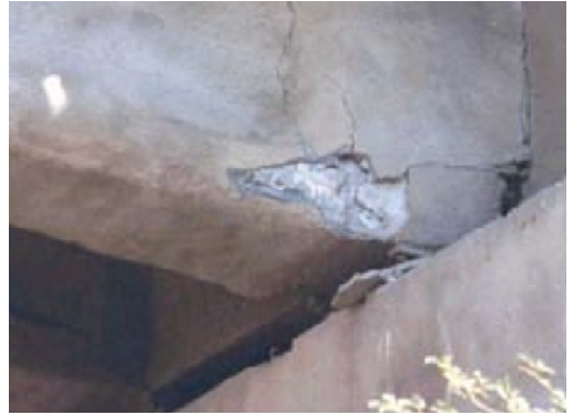
Figure 19-11. Damaged soffit of the girder at the span ends of the New Surajbadi Highway Bridge.