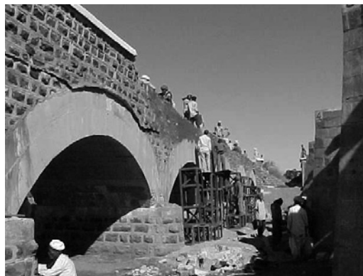
Figure 19-22. Damage to a railway masonry arch bridge. The sidewalls on the arches have fallen off. One of the stone blocks was loosened and partially dislodged from the center of one of the arches. These bridges were also built in 1912 under the meter-gauge rail line.